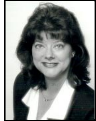
The Virginia Mack Team