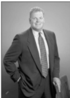
Commonwealth Resident since 1992

Live life to the fullest - doing what you enjoy most - and leave the day-to-day investment and money work to experts who listen to you and understand your needs... the financial professionals of Raymond James.