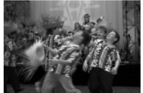
Don't we all wish we were still THIS flexible?