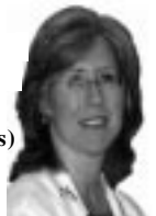
Dr. Carey Therapeutic