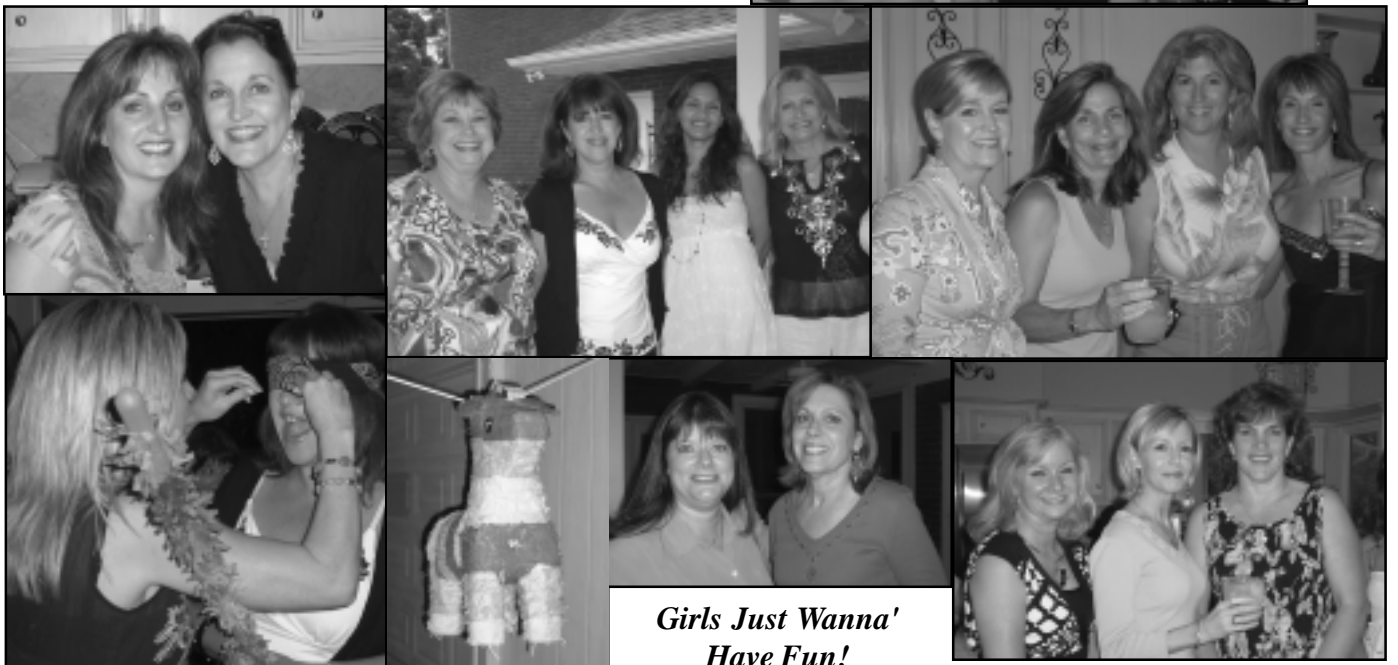
Girls Just Wanna' Have Fun!