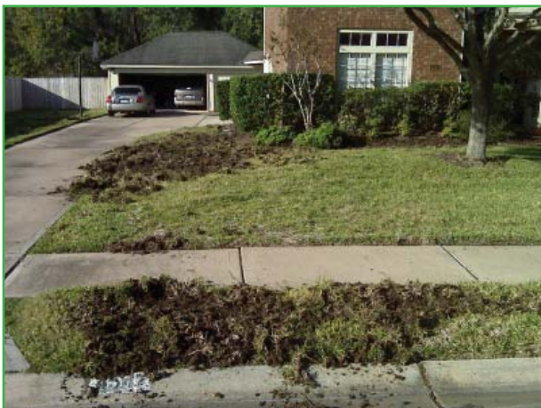
Damage done to a yard on Warwick Dr. This has happened multiple times to several homes!

The factual information included in this article is taken from the city of Sugar Land's Animal Control Department.