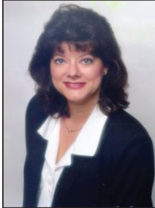
Call Virginia today! Virginia knows how to sell Commonwealth.

CURRENT LISTINGS 19 THETFORD (COMMONWEALTH PARK) 4218 SAINT IVES (OXFORD) 4718 CAMBRIDGE ST. (SUTTON FOREST) SOLDS 3807 SAINT MICHAELS CT. (COMMONWEALTH PARK) Sold for full price - in 14 days