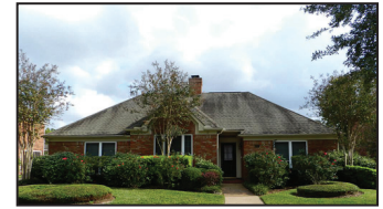
4423 Warwick Dr. One story + 2 living areas, hard wood floors, updated kitchen & baths, double paned windows $309,900