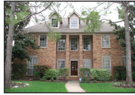
3739 Stocksbridge 4 bed/3 1/2 bath Granite-new roof (3/11) Fresh interior paint & recent carpet $329,900