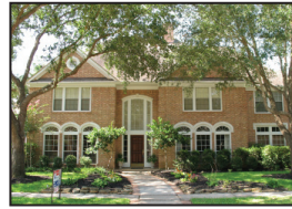
4415 Saint Michaels Ct. 5/6 bedrooms/3 1/2 bath Renovated kitchen w/granite, custom cabinets, hardwood floors $549,900